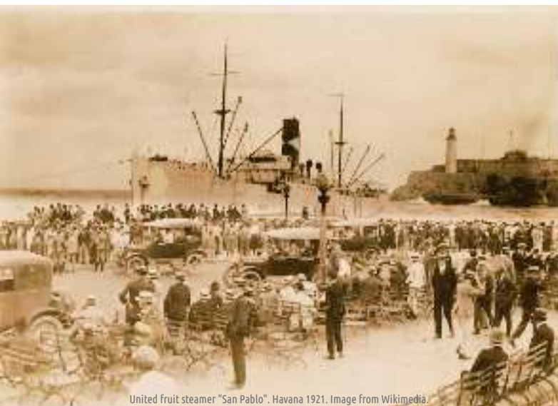
United fruit steamer "San Pablo". Havana 1921.

In 1948, Sam Zemurray, president of the United Fruit Company, hired Bernays to give a facelift to the bad image that his company had both in the United States and in Central America. A man of action, of few words and little culture, he came straight to the point: "I've come to hire you as