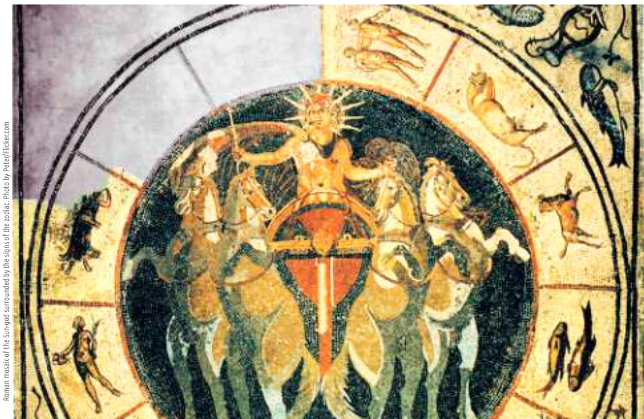
Roman mosaic of the Sun-god surrounded by the signs of the zodiac.

This 'return to the roots' of astrology shouldn't surprise us, especially if we consider the state of chaotic living in which we find ourselves today. It is precisely these concepts of light , luminosity , visibility ,