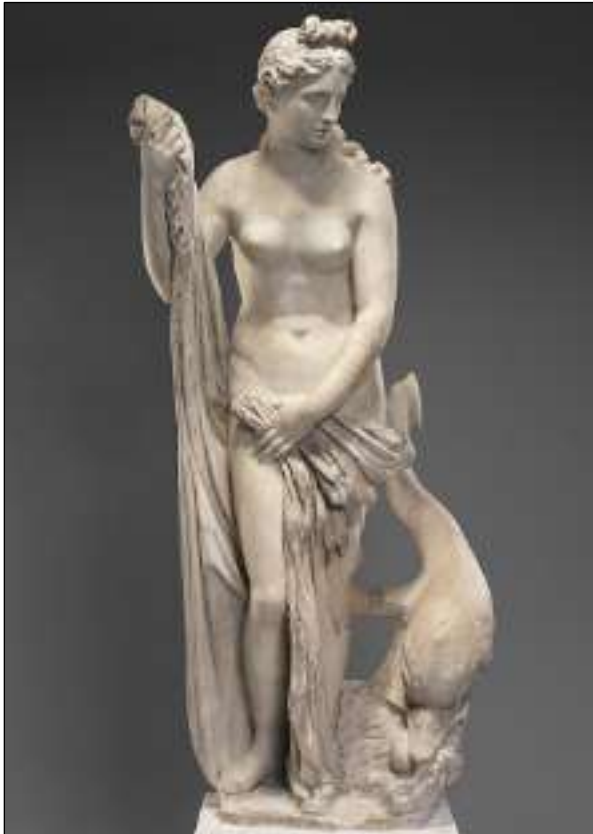
Statue of Venus.

Proclus explained the different levels in relation to statues, which in antiquity were widely accepted as revealing certain spiritual energies under the right conditions. First, the statue was understood literally, i.e. as made of marble, metal or wood. Second, the statue was understood to represent something, a particular belief, deity or virtue. Thirdly and most crucially the statue was understood to become a reflection of something. Finally, at the fourth level,