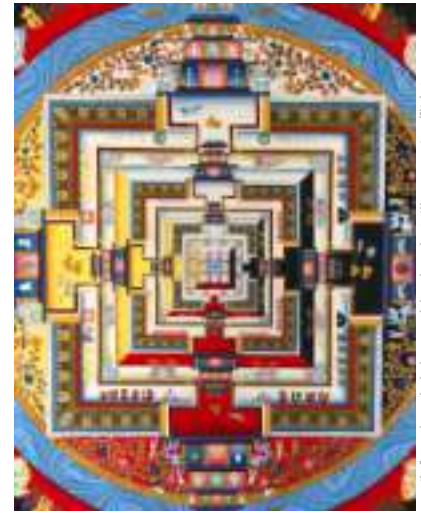
Details from the Kalachakra Mandala.

The Kalachakra teaching has at its centre the correspondence between macrocosm and microcosm, as well as a correspondence between these and the ideal archetype of the Kalachakra mandala - a cosmic blueprint or cosmogram. In the West, this cosmogram has been known through the principle attributed to Hermes “as above, so below”. There is an archetypal pattern behind the microcosm and macrocosm, expressed in the Kalachakra as an ‘outer,’ ‘inner,’ and ‘secret’ or ‘other’; or according