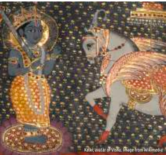
Kalki, avatar of Vishnu. Image from Wikimedia

After the first 7 kings came the Wisdom Holders - or Ridgen/ Kalki in Tibetan/Sanskrit respectively, and Kalki actually means “the unifier or holder of the castes”. It may be that the Ridgen King figure derived from the Hindu myth of the Kalki avatar - who is the 10th incarnation of Lord Vishnu (two other widely accepted incarnations before that of Kalki are Krishna and Buddha). The first Kalki king predicts that there will be an invasion in the future, caused by society being