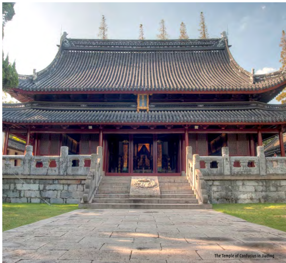
The Temple of Confucius in Jiading

“In the beginning there was only chaos and from this chaos emerged Yin and Yang”