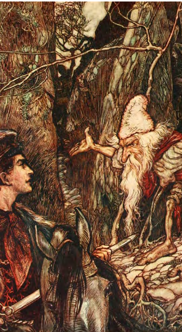
Arthur Rackham: Rumpelstilzchen (1916) (Illustration: The fairy tales of the Brothers Grimm.

Folklore and fairy tales are well known for describing all sorts of incredible creatures: gnomes, dwarfs, mermaids, pixies, giants and speaking animals and birds. The famous alchemist Paracelsus made a classification of these mostly invisible beings and called them ‘elementals’ or ‘nature spirits’. He said that they can be found within the Earth (gnomes, fairies and dwarfs), in the depths of the oceans, lakes or rivers (sirens, nereids, undines and nymphs), in the highest strata of the atmosphere (sylphs and elves) and in the phenomena of fire (salamanders).