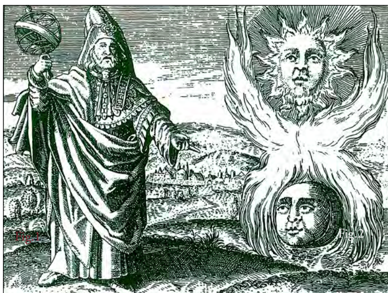
Hermes Trismegistus the alleged author of the Hermetic Corpus , a series of sacred texts that are the basis of Hermeticism . Engraving from an allchemical manuscript.

Further readings : The Greek Magical Papyri in Translation by Hans Dieter Betz.