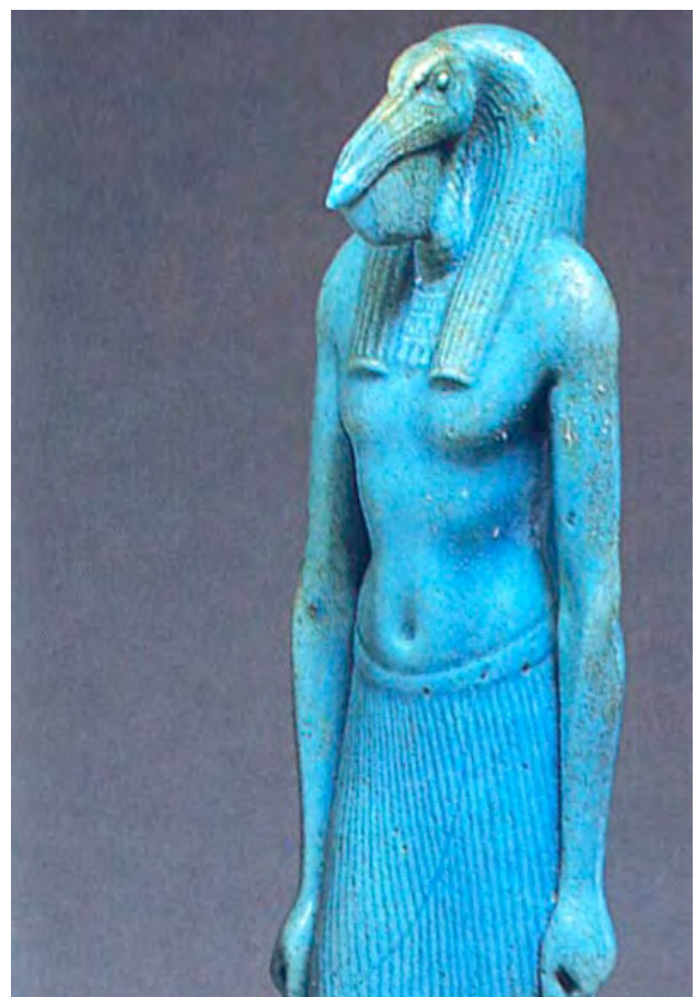
Statuette of the Egyptian god Thoth . Ptolemaic period 304 - 30 BC.

"dimension" of the mind as the intermediate level between the human and the Divine. Hermes also came to represent those intellectual and eclectic qualities (in the human being) that were characteristic of the Hellenic spirit and that