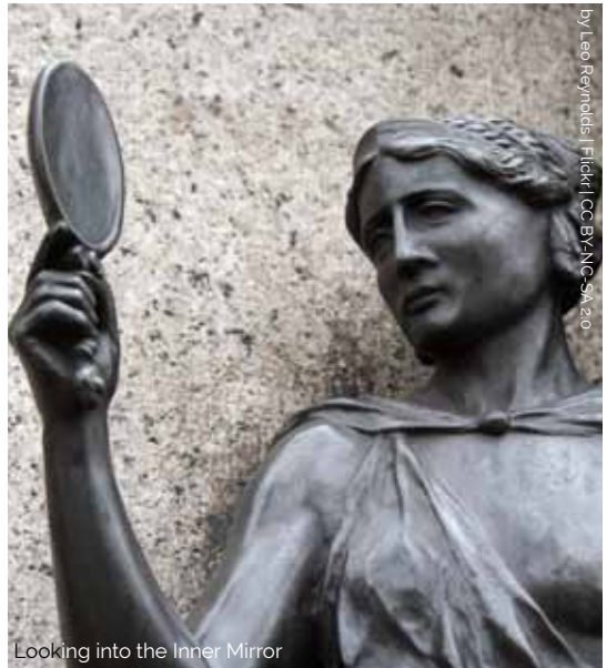
Looking into the Inner Mirror

If with a firm will we turn the mirror even higher upwards, the adversities of the world will disappear and a heaven of light will bring beauty and joy to our hearts. We will be naturally disposed towards success and joy, and wisdom will unfold, revealing true marvels as well as the hidden causes of the visible things. We will see the hands of God in every work and his immeasurable Thought reigning over every idea and every form.