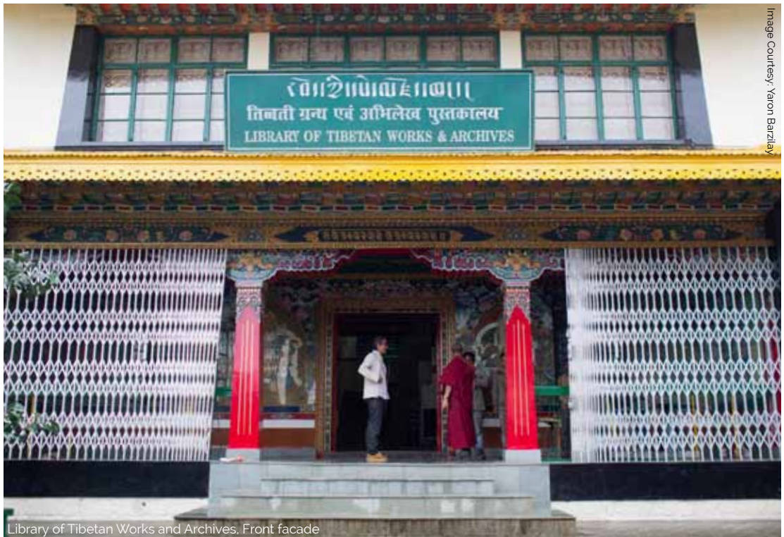
Library of Tibetan Works and Archives, Front facade